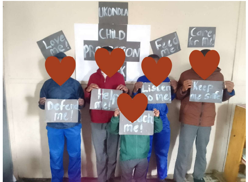
UKONDLA _ AFTER CARE CLASS