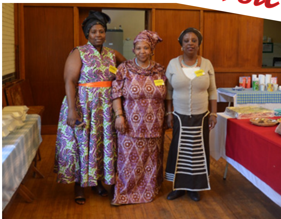
Some of our Child Care Workers getting ready for our 2018 Annual General Meeting