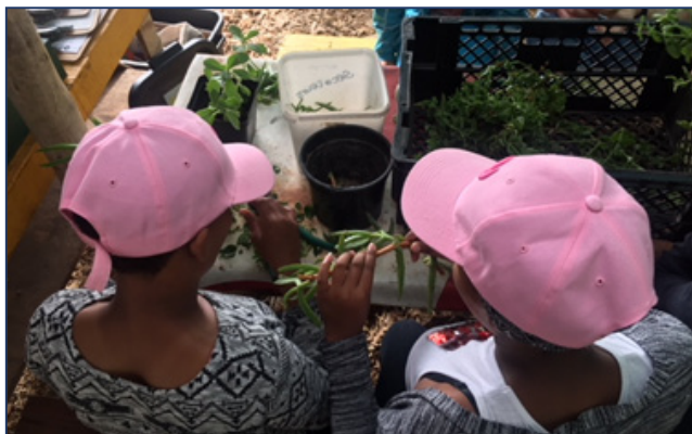
The girls had a go at planting their own plants

UKONDLA 2 and 3 are situated on the premises of Sizakuyenza Safe House, cnr Eisleben and Phumelele Roads, Philippi, Cape Town 7750.