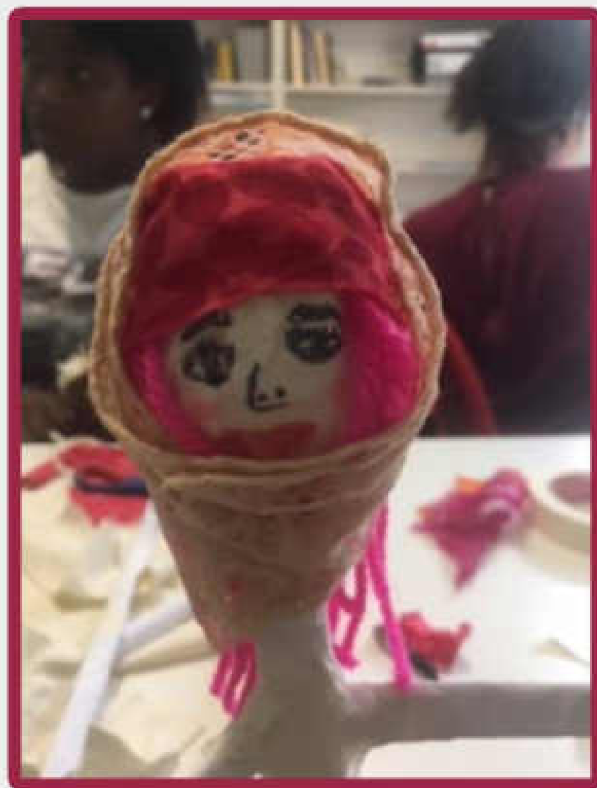
Doll making workshop