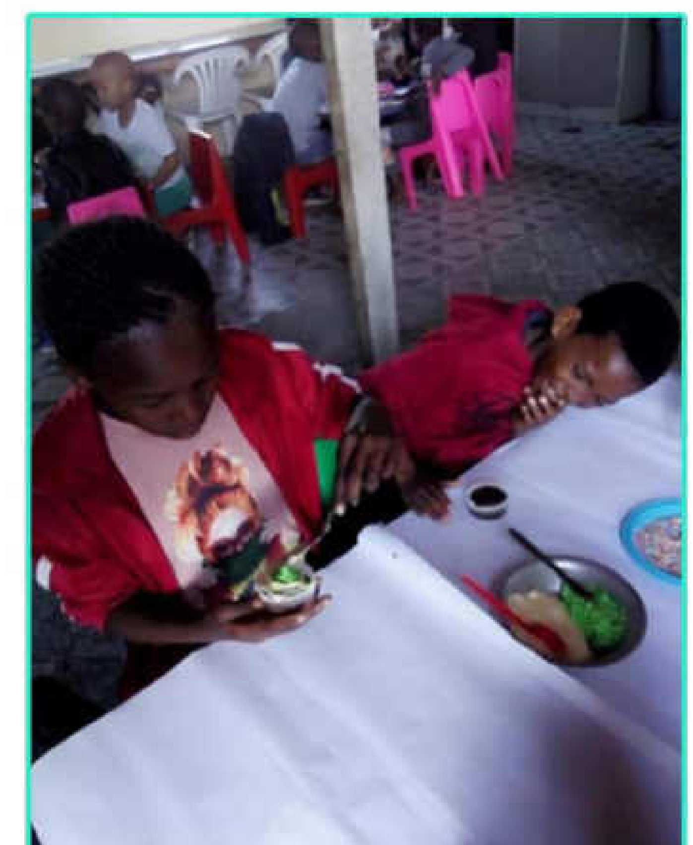
LITTLE ONES HAVING FUN DECORATING THE CUPCAKES