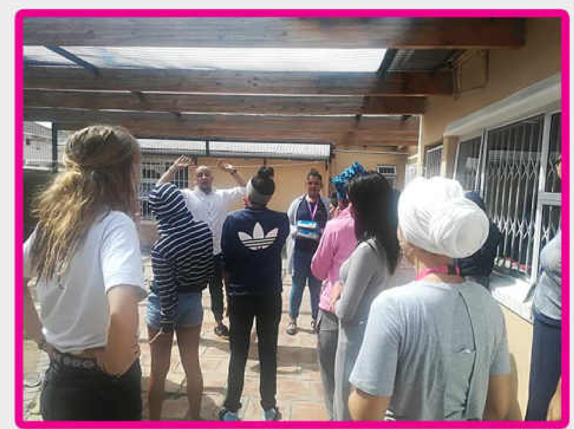
Visitors interacting with girls