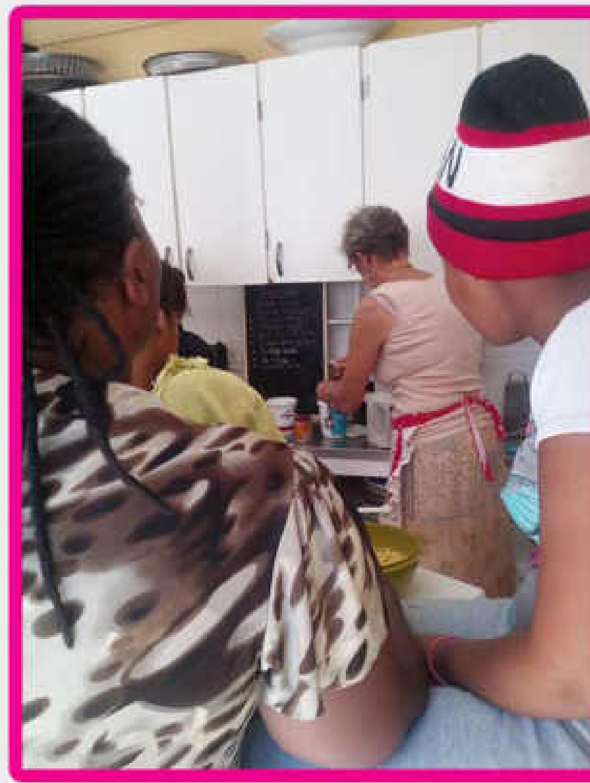
Children enjoying baking with a volunteer