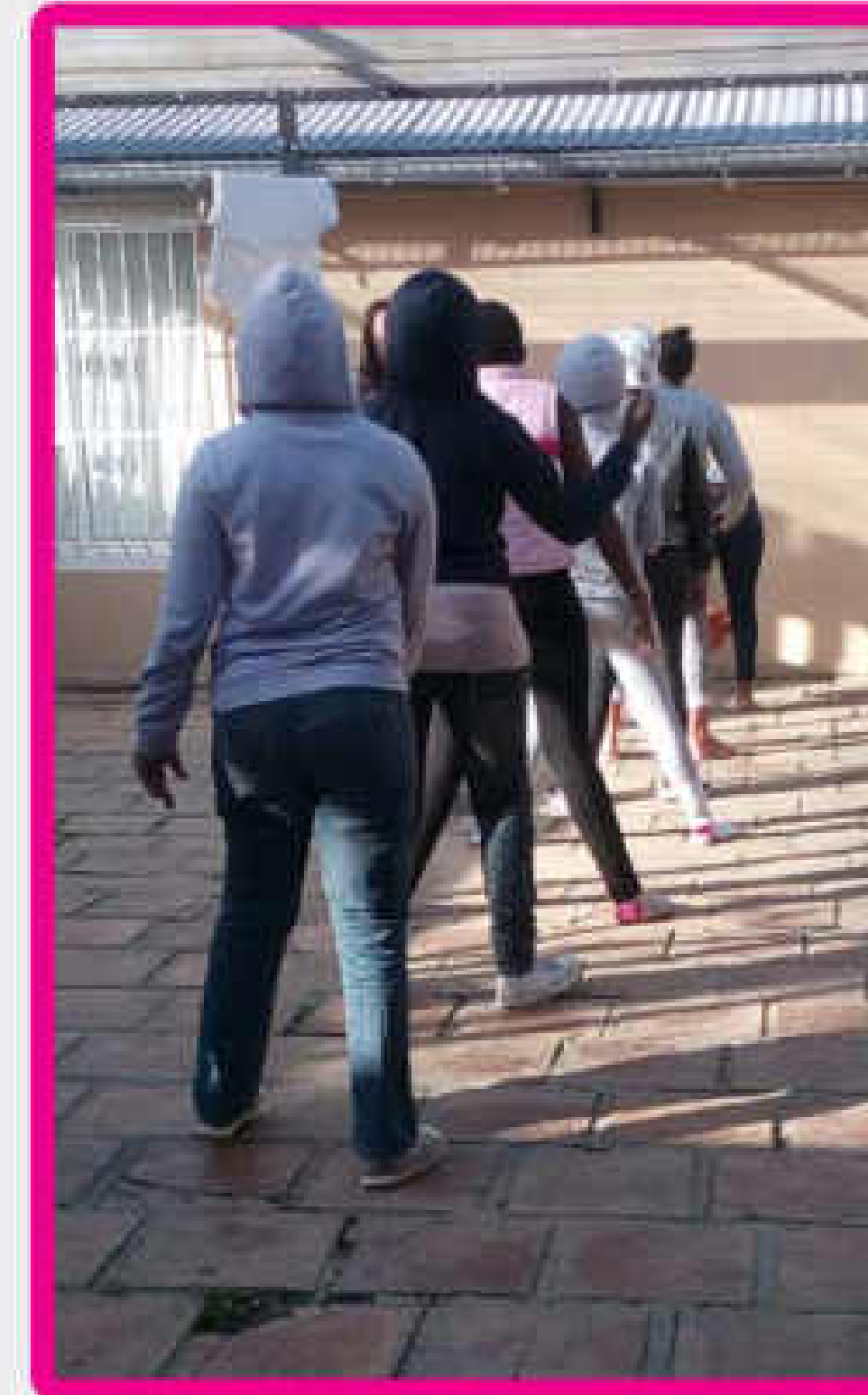
Games during the holiday programme

As children drop out of school before they drop out of home, a homework support program, coupled with counselling to parents and children, helps them stay in school.