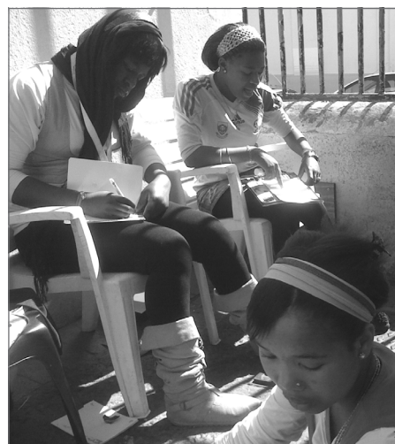
Girls busying themselves in the courtyard at Ons Plek